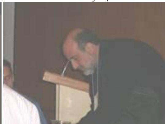
Nassim Nicholas Taleb, and dozens more!