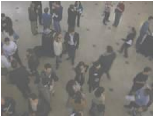
Participants look for chairs to sit for