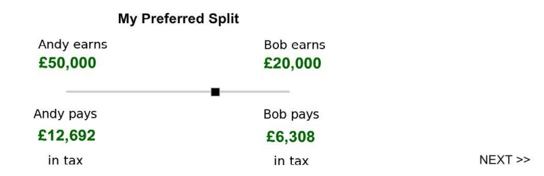
Figure 1: Screenshot from the Experiment. In this case the taxation situation was described in terms of tax paid, not residual income, and amount, not percentage.

Please click on the grey line below and move the slider to indicate what you think is the best split. The slider is calibrated so that the total amount of tax collected from the two of them per call is always the same.